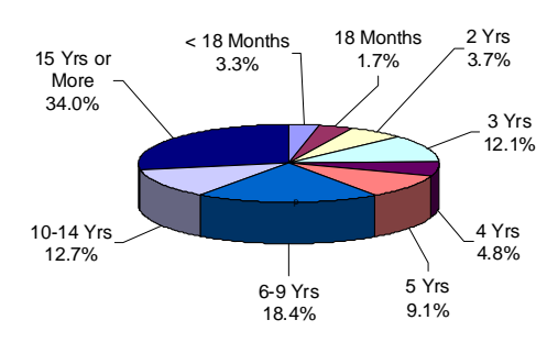
Of the 14,353 Male Offenders in Other Facilities, 73% (10,495) have mandatory minimum terms.

The median mandatory minimum term for Male Offenders in Other Facilities is 7 years (ADTC excluded).